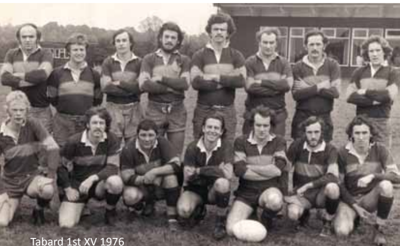
Tabard 1st XV 1976

Could all current members please inform the Membership Secretary of any change of address or other personal details so that the mailing list can be kept up to date.