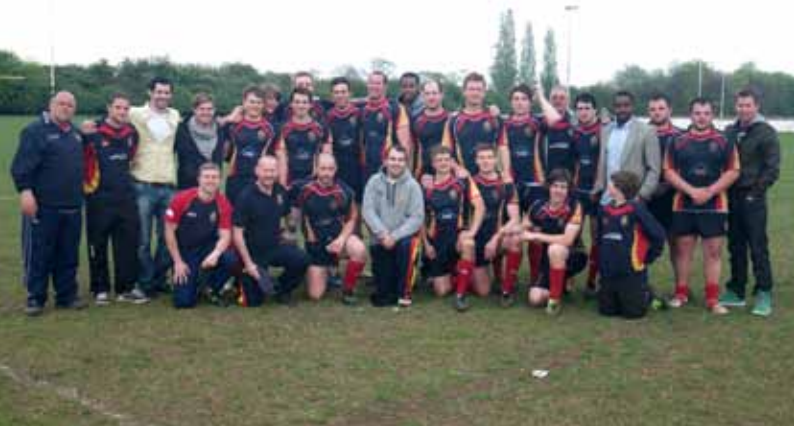
Tabard 1st XV 2011