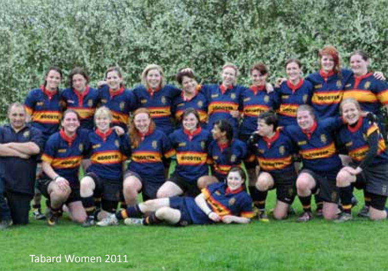
Tabard Women 2011